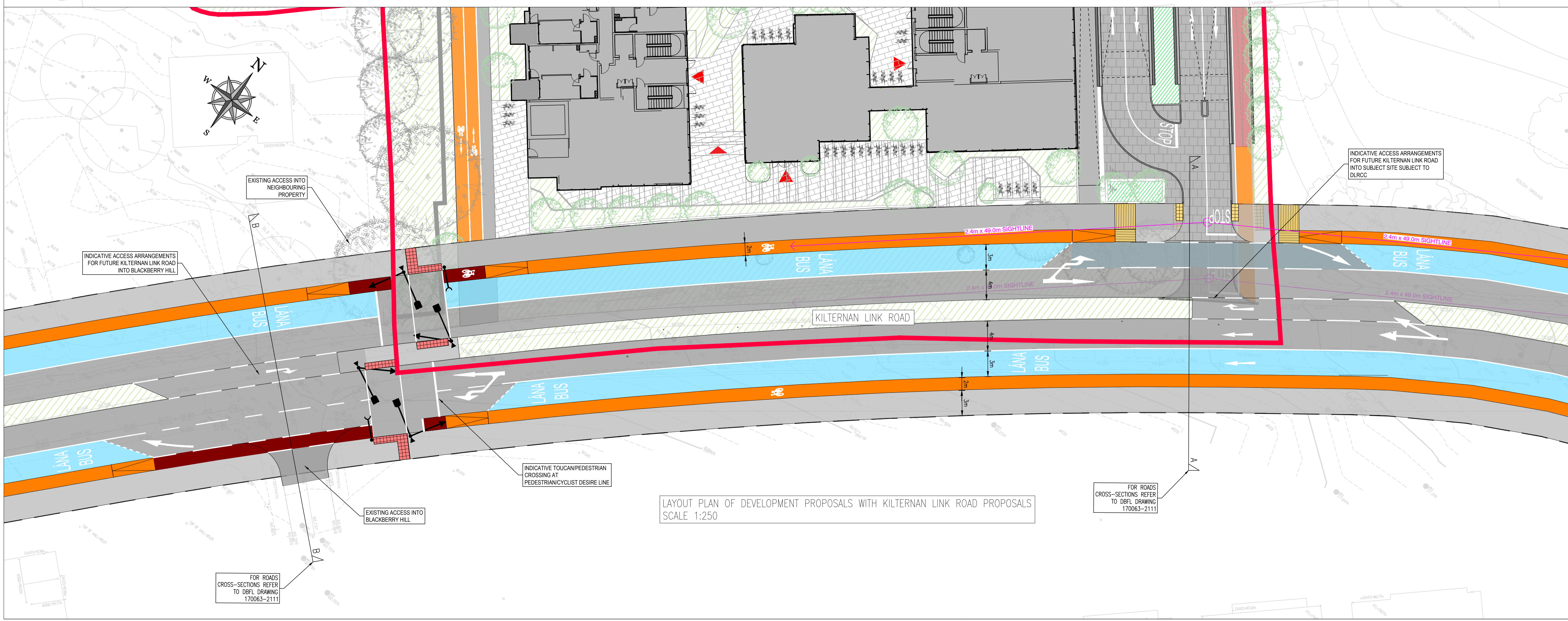
LAYOUT PLAN OF DEVELOPMENT PROPOSALS WITH KILTERNAN LINK ROAD PROPOSALS SCALE 1:250

© COPYRIGHT OF THIS DRAWING IS RESERVED BY DBFL CONSULTING ENGINEERS. NO PART SHALL BE REPRODUCED OR TRANSMITTED WITHOUT THEIR WRITTEN PERMISSION.